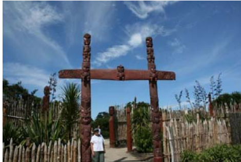
Hamilton Gardens, Maori gardens