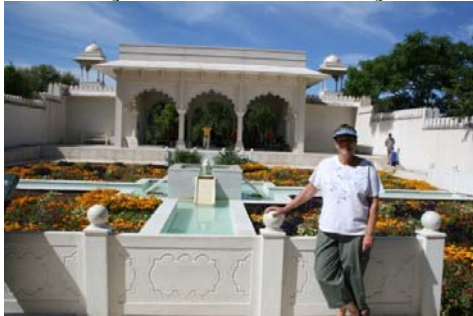
Hamilton Gardens: India gardens section